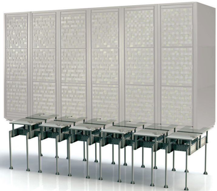
Raised floor structure removed for clarity

Used to supplement the weight capacity of new or existing raised floor systems adding 850lbs per 2'x 2' tile beyond the tile's original load rating. The design load and uniform load both as the mounting pan acts as a force distributor plate, so that translates to a uniform load increase of 212.5lbs/sq.ft, the CableTalk Underfloor Support is designed to work in conjunction with a standard raised floor system by supporting the floor tiles directly.