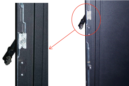
(View of bottom half inside door, showing 3 point lock mechanism)