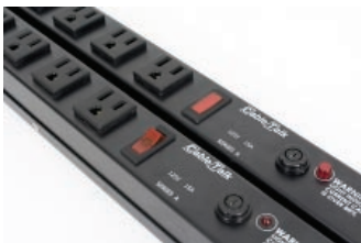
Close-Up Switch Disabled Option & Standard Switch