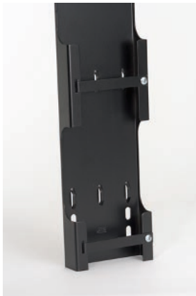
Ladder backbone style