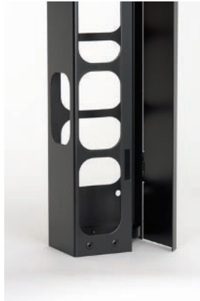
Channel style with door ajar