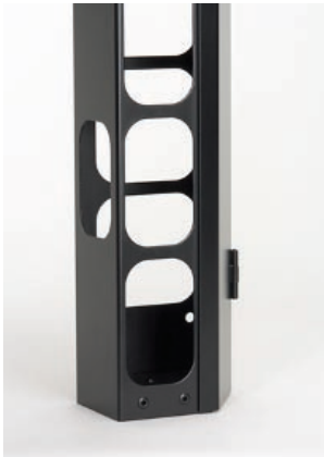
Channel style with door closed