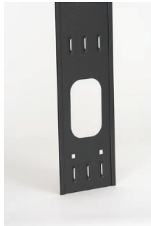
Flat backbone style