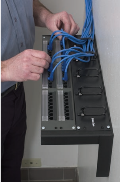
Wall-mounted Hub bracket with hub and cable manager installed