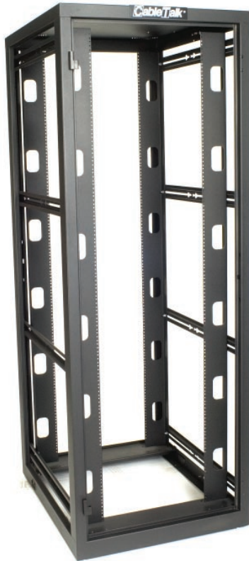
Mounting angles sold separately. Shown with optional caster plates

Note: All of our cabinets are fully customizable. If desired options are not listed, speak with your CableTalk distribution partner.